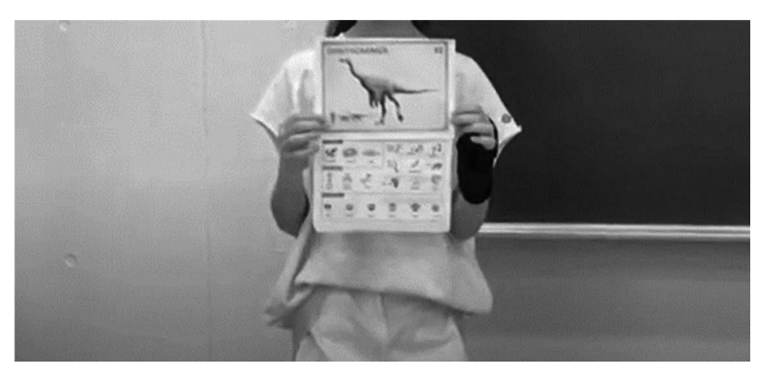
Figure 2: The Final Outcome (Video-based Presentation)

The final outcome was for students to make a final presentation about their favorite dinosaur, which was captured as a video recording. Based on recommendations that suggest the effectiveness of using ICT tools in learning (Herrero & Vanderschelden, 2013), students used tablets to record each other's presentations in pairs (Figure 2).