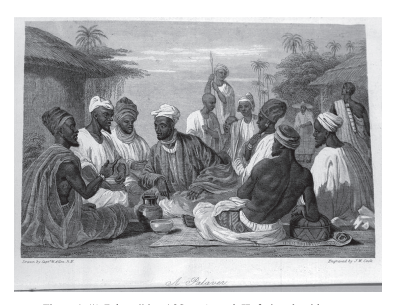
Figure 2. "A Palaver" in A Narrative, vol. II, facing the title page.

As this word "palaver" was used in A Narrative five times and Captain Allen chose an illustration of Africans sitting together and conferring entitled "A Palaver" to face